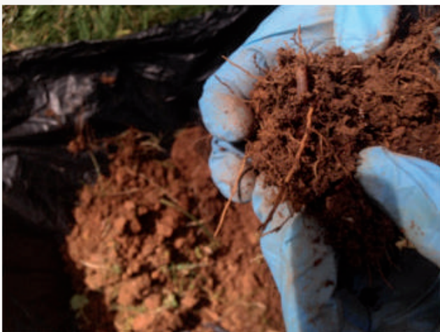
Photo 02.1. Manual extraction of soil fauna.

To avoid mortality keep the containers cool (in the cool box) and away from sunlight until they can be processed in the laboratory. Keep each replicate sample separate throughout the sorting and identification process. If you do not proceed with chemical extraction, put the sorted soil back into soil pit and leave the spot in a tidy state