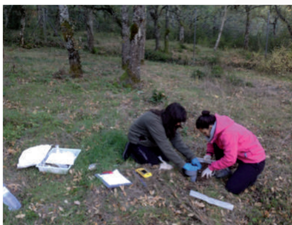
Photo 08.1. Material and installation of mesh-bags in the field.