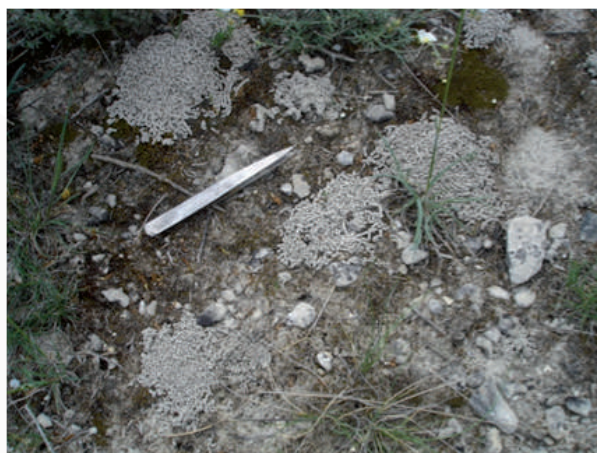
Photo 04.1. Example of granular casts produced by Prosellodrilus psammophilus Qiu & Bouché, 1998 a native earthworm from the semi-arid lands of “Los Monegros” at the Ebro basin (Spain).

First, mark a small area (e.g. 10×10 cm) adjacent to the macrofauna monolith (protocol KEYSOM-02). Collect all biogenic structures that are visible on soil surface within this area and describe them as globular (compact) or granular (loose) (Photo 1). If possible, identify the species that produced the structures.