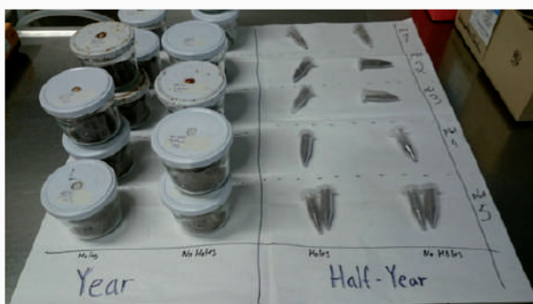
Photo 08.4. Close-up of the soil retrieved from the mesh-bag and packed in different containers for subsequent analyses.