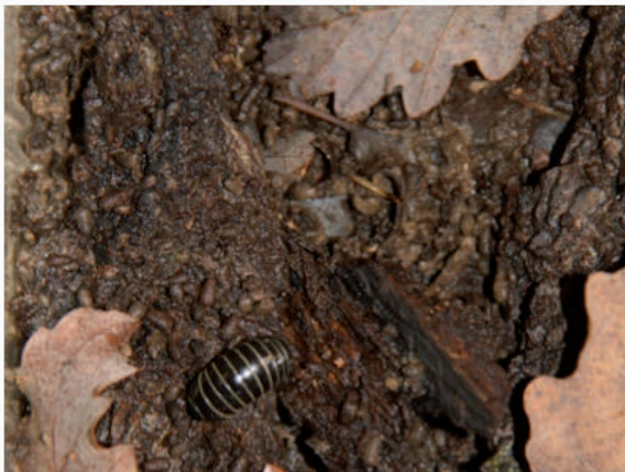
Photo 04.2. Pellets produced by Glomeris marginata L. (Diplopoda) in a Quercus sp. forest.