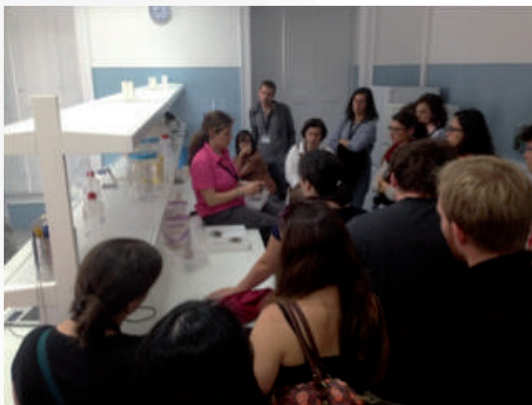
Photo 06.3. Example of basic soil characteristics determination in the lab in front of several students.

Store in a cool, dry and dark place for future chemical analysis, if required