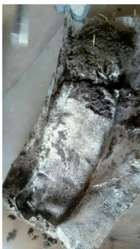
Photo 08.3. Close-up of the mesh-bag after being retrieved from the field (a large bioturbation and soil mixture is observed).

Cut off the top part of the mesh and then cut open the mesh vertically (along the core from top to the bottom) and spread the mesh to both sides. Measure the length of the organic horizon on top and take pictures / note peculiarities if you see anything interesting (e.g. when most litter apparently has been moved outside, which we encountered once in a bag with holes). Ignore any white/clay that has fallen outside the mesh bags. Subdivide the core into 0-5, 5-10, 10-20 cm layers, put these separately into labelled plastic containers (or plastic bags, but making sure the cores keep their structure during transport) and store them in a cool box (or at least in a cool place) until you have collected the rest. The wet and largely unmodified 10-20cm rest is more easily lifted (lower loss) when using your hands rather than a shovel.