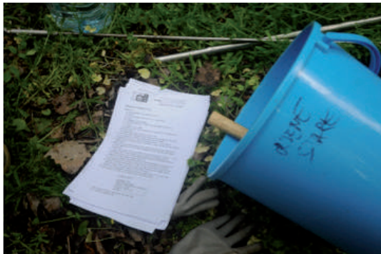
Photo 05.1. Example of the field material normally used in soil sampling studies.

From each plot randomly collect 10 soil cores to a depth of 20 cm including the top organic litter layer, with a fresh weight of about 0.1 kg, and place them in the bucket lined with plastic bag. The 10 soil cores collected from each of the four plots are kept separate. The ten soil cores from the same plot are thoroughly mixed in a bucket into one large sample of approximately 1 kg. Collect 25-g sub-sample from each of the four mixed bulked soil sample and put into a labelled plastic bag. Join this one with the four small bags (four plots) into one plastic bag.