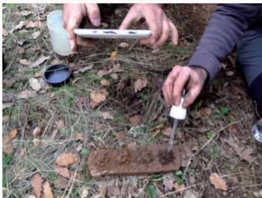
Photo 06.1. Testing the reaction to HCl to detect carbonates in soil under field conditions.