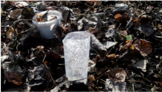
Photo 08.2. Close-up of the mesh-bag before folding the upper part in the field.